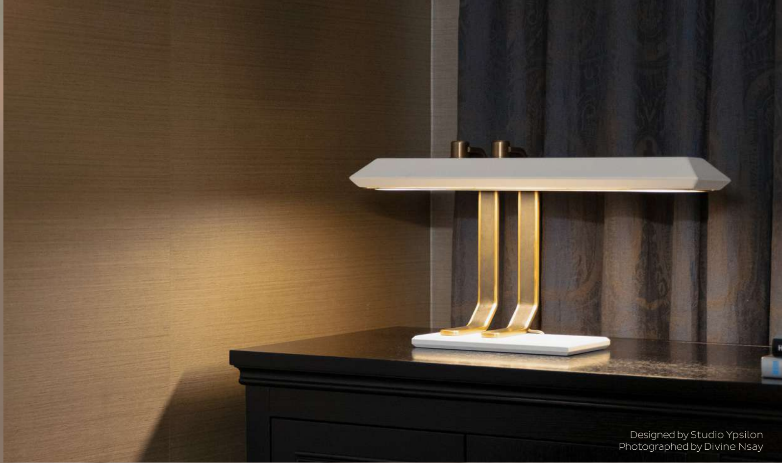
Designed by Studio Ypsilon