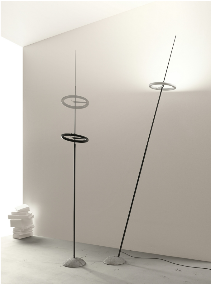
Ringelpiez INGO MAURER UND TEAM 2016

The aluminium ring with integrated dimmable LEDs can be fixed as up- or downlight. Without tools, you can adjust the angle of the ring, the rod or even change the orientation of the LEDs. The rod in carbon fiber can be fixed vertically or at an angle of 15° in the base. There is no visual noise around the slender pointed rod, the cable is inside. Even so, the rod is extendable from 150 to 210 cm. Transformer with slide control. Dimmable. The ring with LEDs is only available in black.